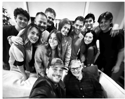
Thanksgiving at McNown's